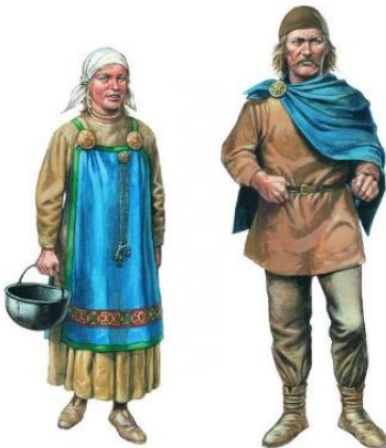
A Viking farmer