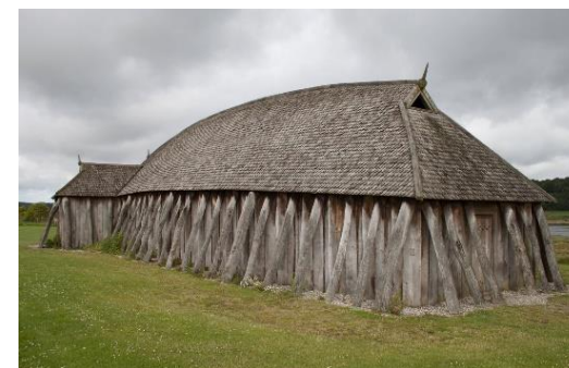
A Viking longhouse

The Vikings travelled across the seas in Longships.