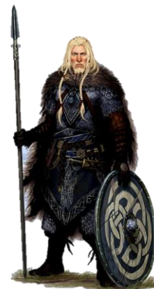
A Viking warrior