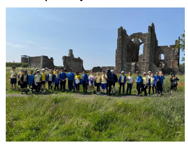
Year 4 trip to Holy Island

Year 4 enjoyed their trip to Lindisfarne to see the priory where the Vikings first invaded in 793AD. We got to walk around the island, look at the castle and enjoyed our lunch in the sun with a lovely view of the sea.