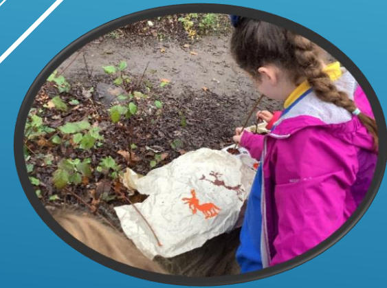
We tried a style of cave painting.