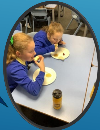
We tasted foods that have been around since prehistoric times.

We read the evidence available to find out how we know what was eaten.