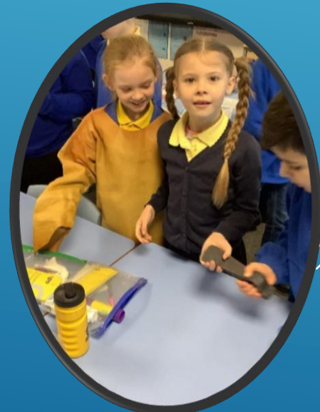
We handled artefacts.