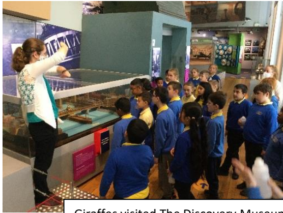
Giraffes visited The Discovery Museum to view the Newcastle Bridges display with the focus on the use of the river and local area. Whilst also taking part in a bridge building workshop.