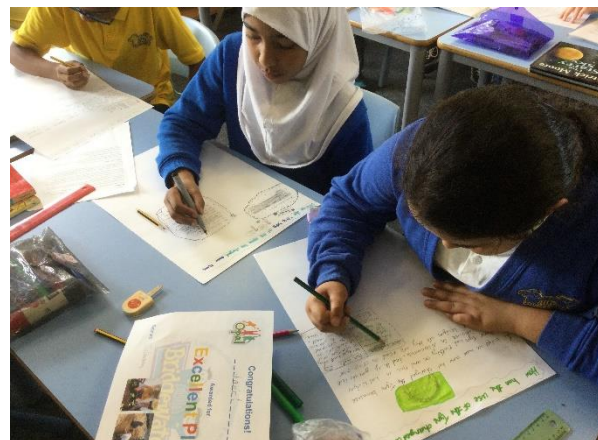
Giraffes worked in mixed ability groups to share their research and knowledge with each other and work together to create a group presentation creating posters of their own designs ready to present their conclusions to the EBL question.