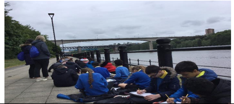
We walked along the river Tyne to explore the landscape and experience the structure of the bridges for ourselves and how they were being used. Along the way we stopped, we create some observational sketches of the bridges.