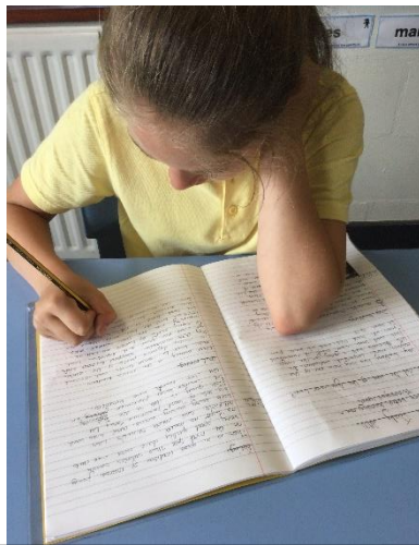
Following our research on uses of the river Tyne, coal mining, bridges, shipbuilding, fishing and industry we wrote a non-chronological report using our researched information.