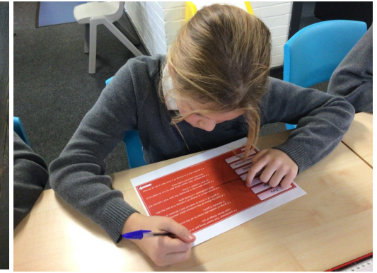
Lesson 2– Children introduced to key topic vocabulary e.g. jury, trial and magistrate. Can you match the keywords to their definition by the end of the lesson? Children independently researched on iPads and using dictionaries.