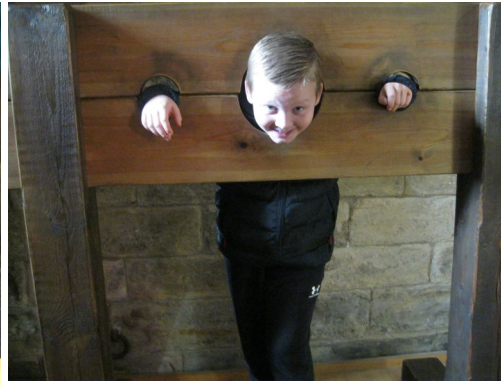
Enhancing learning– Children visited the Castle Keep which linked work on the local area with the crime and punishment topic. This provided a hook and linked with our curriculum drivers.