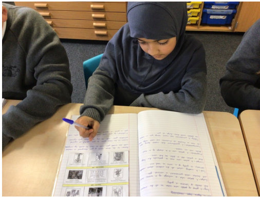
Lessons 3-5– Children developed knowledge of crime and punishment throughout history. This was done through a dual objective approach including writing diary entries, story boards and a non-chronological report.