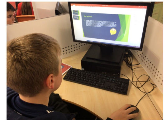
Lessons 9/10– Children collated their final ideas about the enquiry question using PowerPoint. They then presented these to their peers and spotted similarities and differences in ideas and opinions.