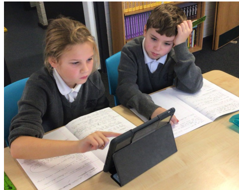
Lesson 8– Children had an extended lesson to gather their research in pairs. They put their ideas together to answer the enquiry question. iPads were available to find supporting evidence.