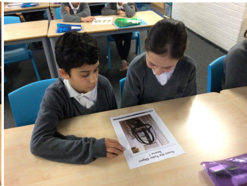
Lesson 6-7– Children continued to develop knowledge of crime and punishment throughout history. This involved exploring sources. At the end of these lessons children wrote short paragraphs summarises their views e.g. Were Tudor punish-