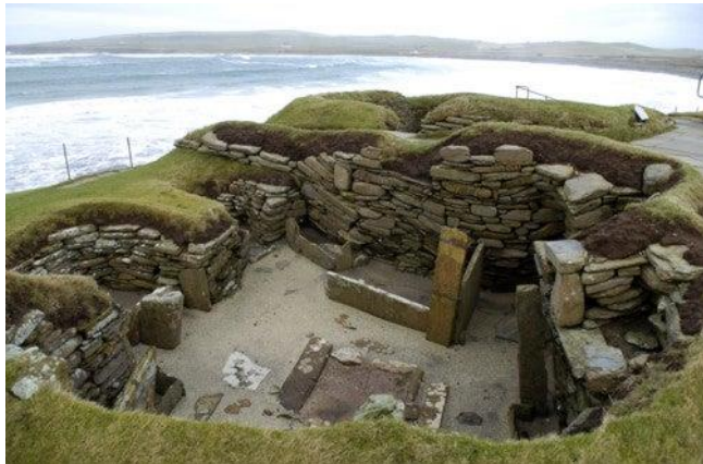
Skara Brae: A well preserved Stone aged village in Orkney Scotland.

hill fort A settlement surrounded by a wall, on top of a hill.