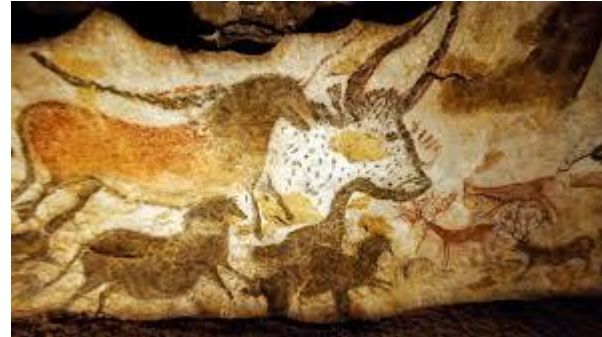
Lascaux: France: Famous Cave paintings.