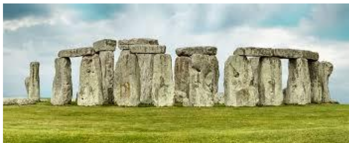
Stonehenge: The famous Stone Age stone circle in Wiltshire England.