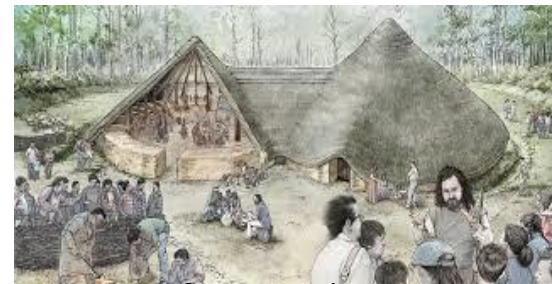
Iron Age farmstead