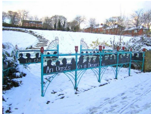
'Oasis Gate' by William Pym

You can plot these sculptures on a map of Hodgkin Park.