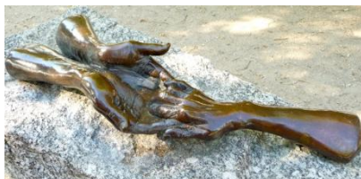
Welcoming Hands, 1996