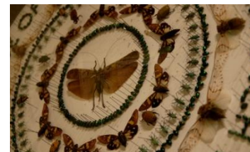
Victorian Fancy (Detail)