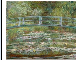
Bridge Over a Pond of Lilies (1899)

- Water Lilies is one of Monet's most well-known paintings. It is a part of a series on water lilies. -It is one of his larger paintings, measuring 101 x 200cm, and is an oil-on-canvas. -At the time of producing this, Monet was already 70 years old, and mainly painted the natural beauty in his own garden and pond in Giverny. -The paintings demonstrate Monet's interest in natural beauty, and how it changes in light.