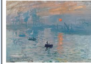
Impression, Sunrise (1872)

- Impression, Sunrise is often credited with inspiring the impressionist movement. -It shows the port of Le Harve – Monet's hometown at the time. The two small boats in the foreground and the red sun are the main subjects. -Features of industry are shown in the background, billowing chimneys and a hazy sky.