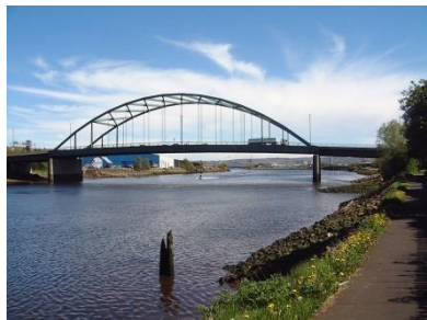
Scotswood Bridge going over the River Tyne.