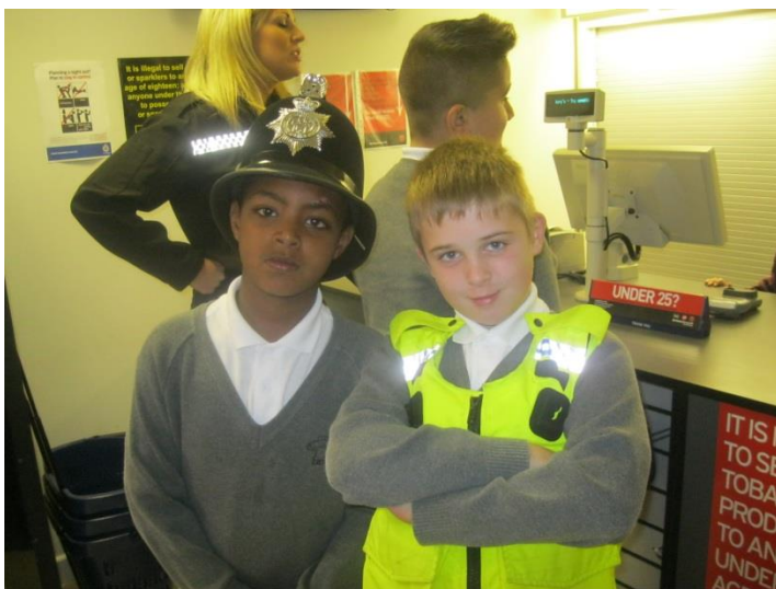
We learned about what happens to criminals caught stealing!