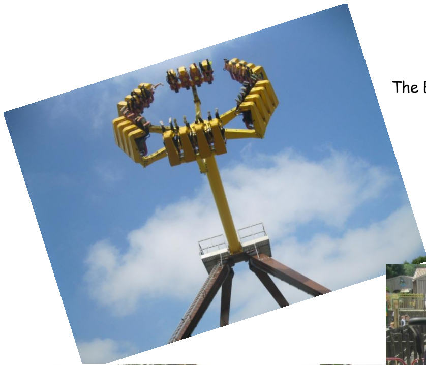
The Eagle's Claw was really scary!