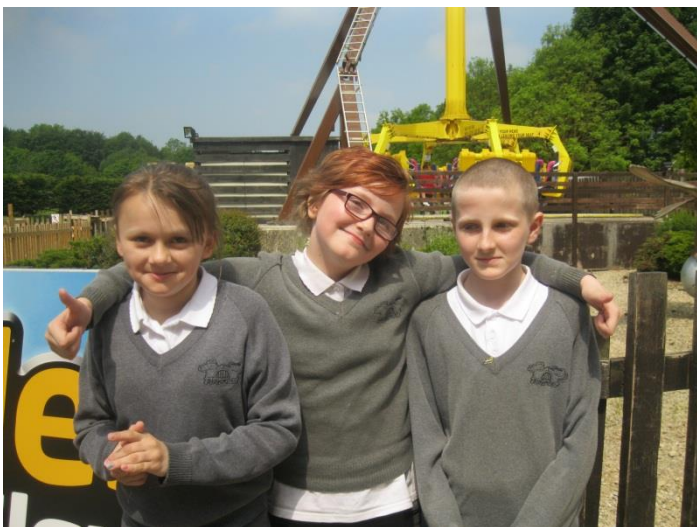
We had a fantastic time!