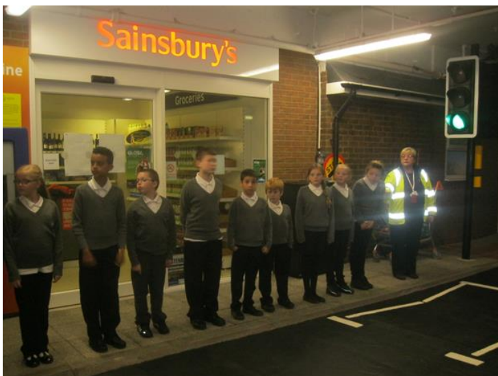
Learning to cross the road safely!

Safety Works has amazing, life-like facilities including a true-to-life metro station, street, houses, park, shops and a police station (which includes a replica cell!). It helped us to learn how to stay safe in a variety of real-life circumstances and prepare us for becoming more independent as teenagers.