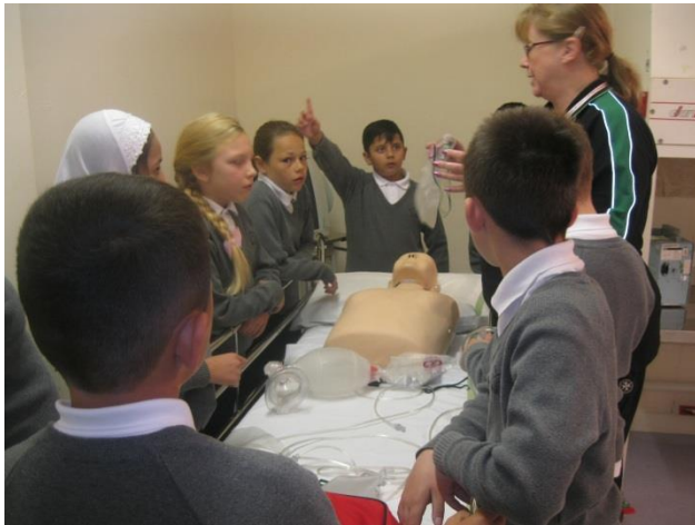
First Aid with St. John's Ambulance