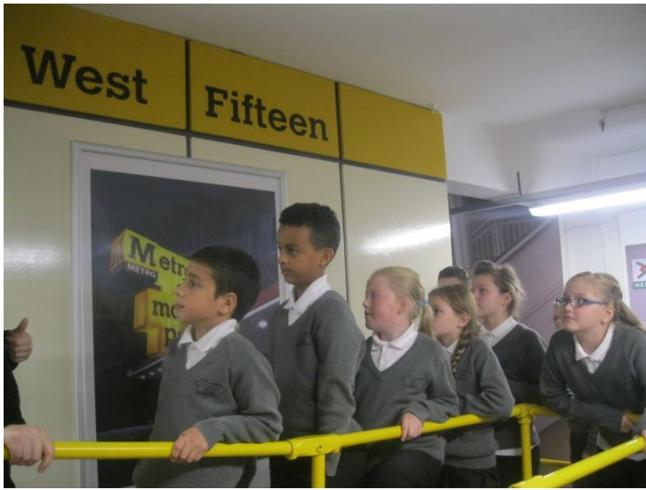
Learning how to be safe at Metro Stations